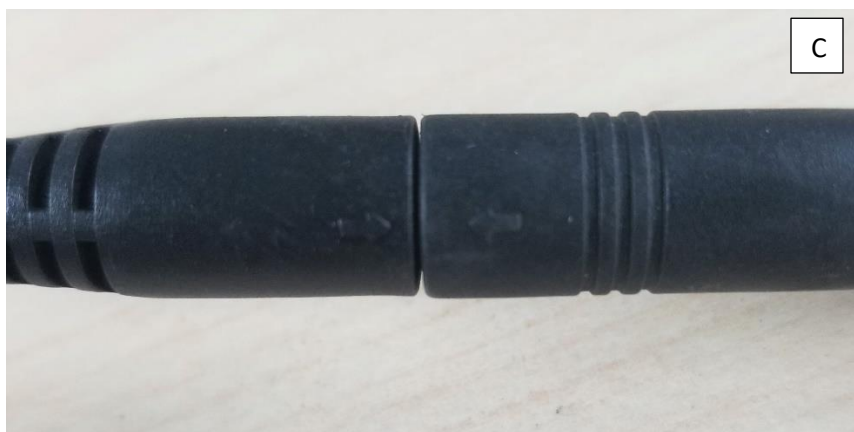
Power Cable Connector