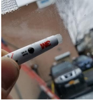
Squeeze to release primer & apply Primer to the Windshield