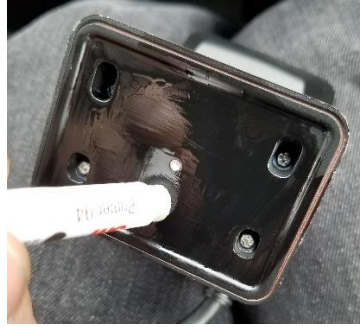
Apply Primer to the Bracket