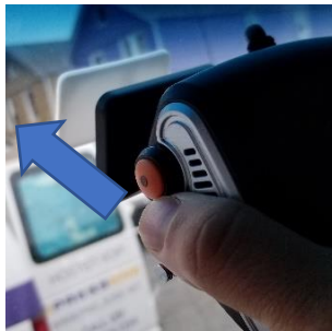
Mount the Recorder to the VHB tape