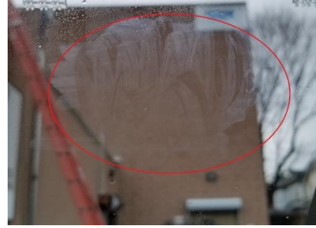
Wait for Primer to dry