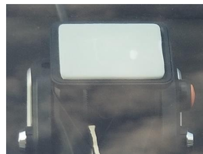
No air bubbles on windshield

After mounting the Recorder apply pressure for 30 seconds.